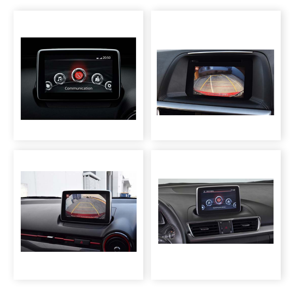
The photo is provided for reference only. Appearance of the control panel and monitor may slightly differ depending on the car model.