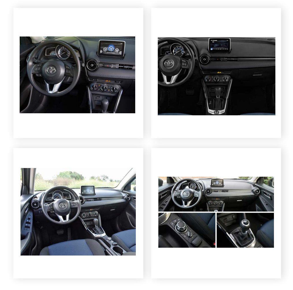
The photo is provided for reference only. Appearance of the control panel and monitor may slightly differ depending on the car model.